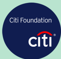
CITI FOUNDATION Champion for Equity Award